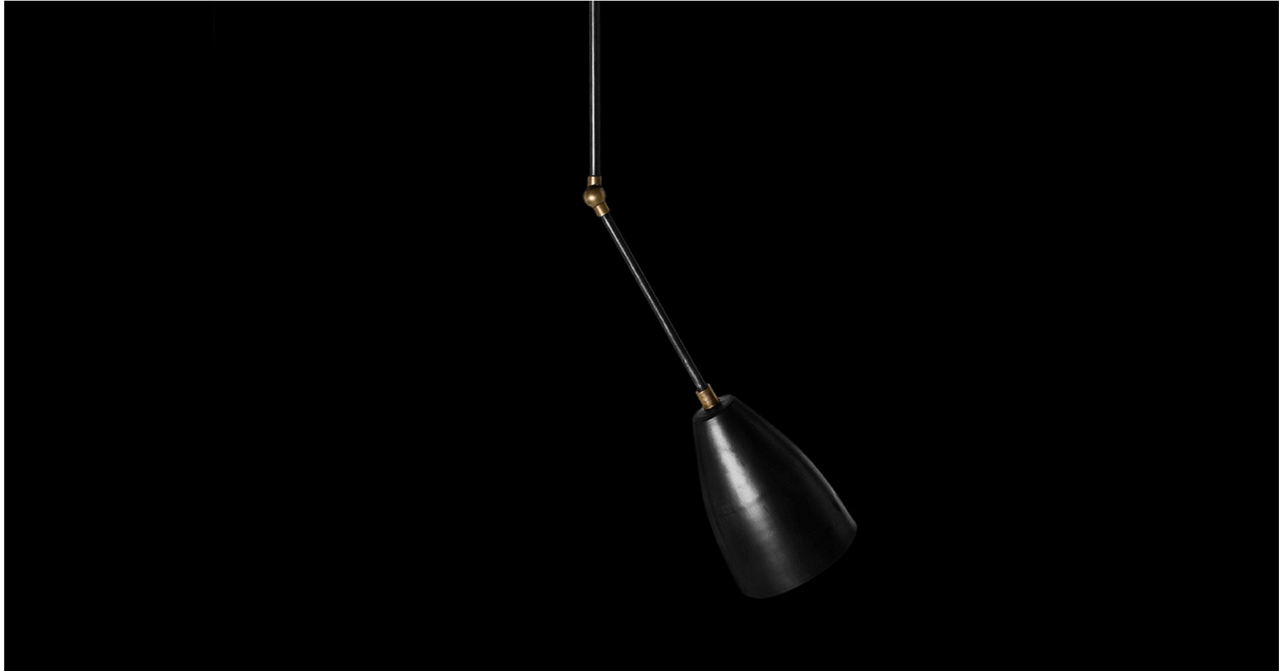
SERIES : TWIG