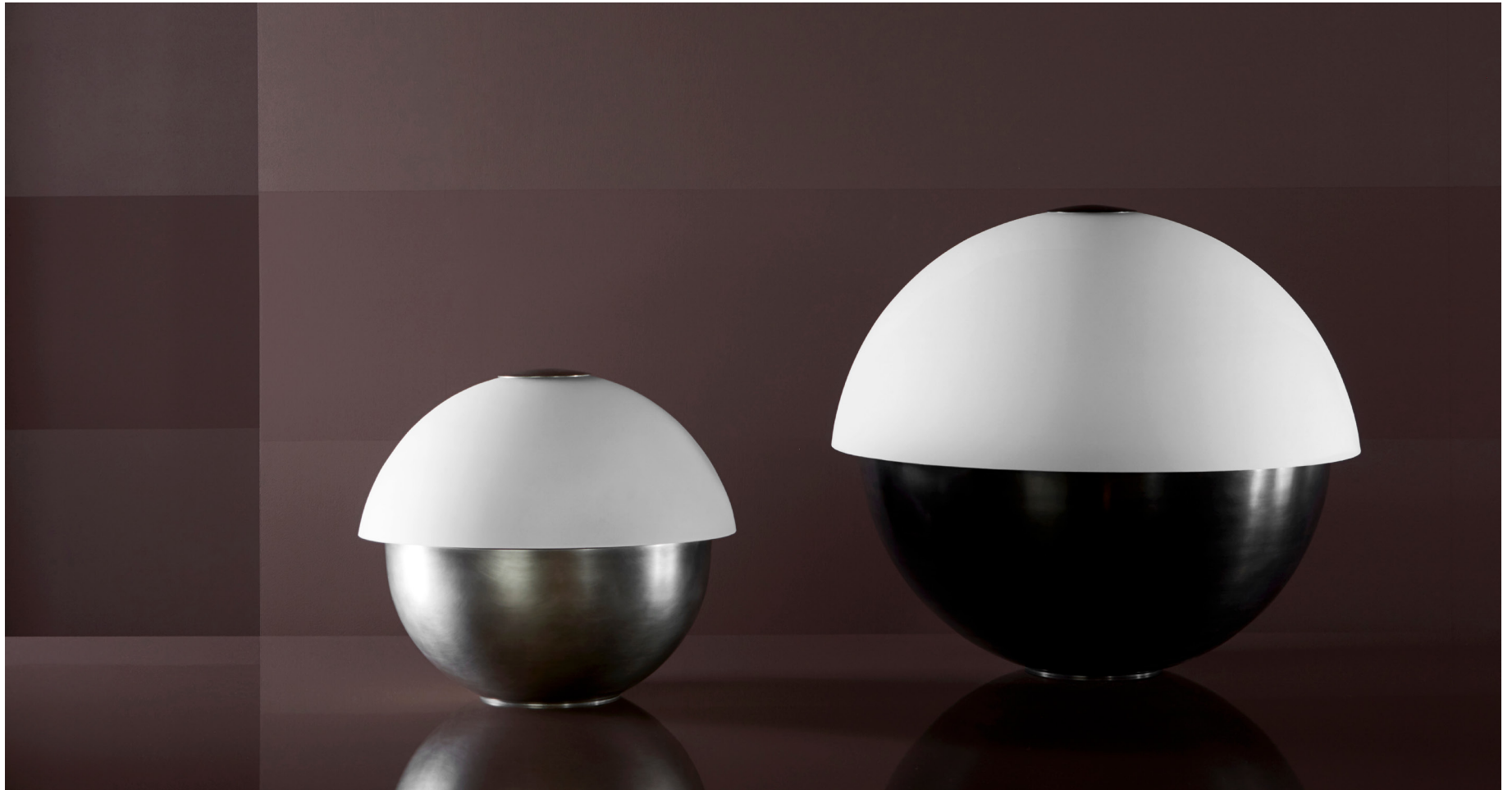
SERIES : AXON