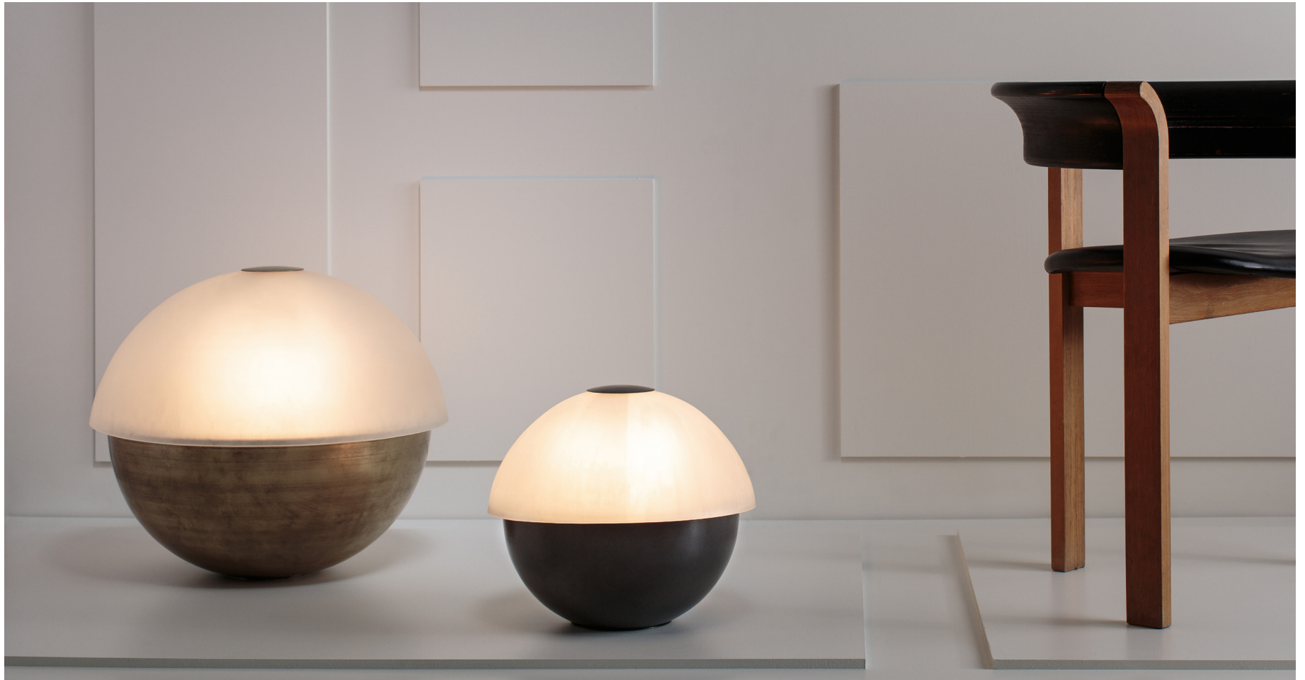
AXON : LARGE, AGED BRASS