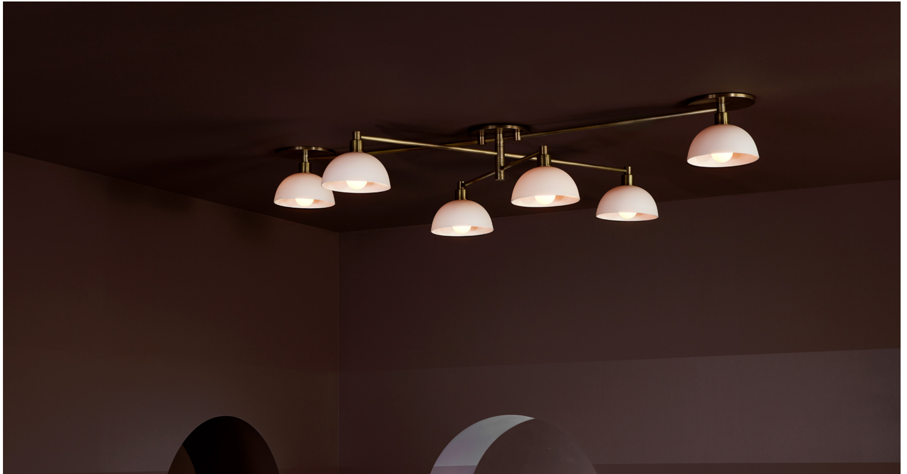
AGED BRASS / PORCELAIN