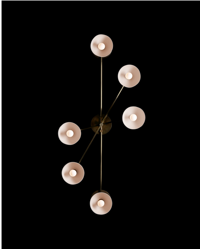
AGED BRASS / PORCELAIN