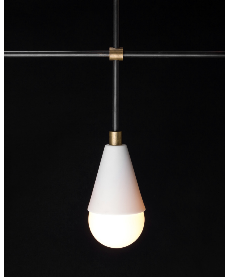
AGED BRASS / BLACKENED BRASS / PORCELAIN