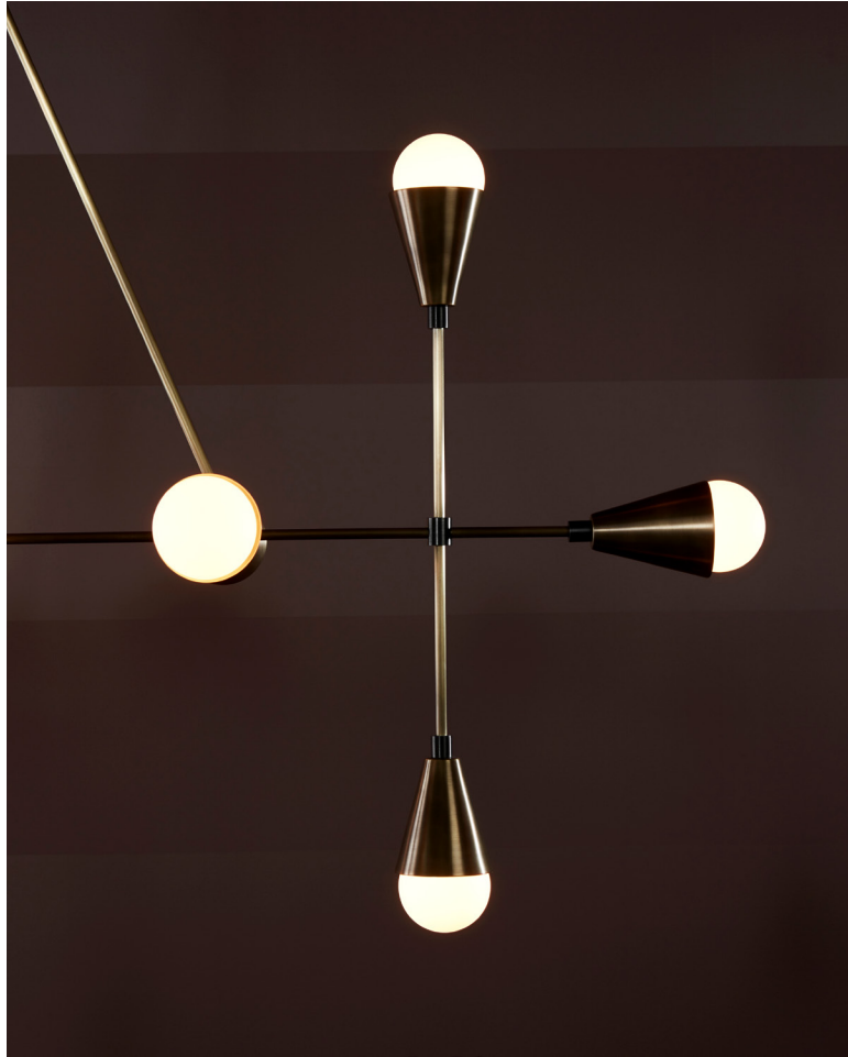
AGED BRASS / BLACKENED BRASS