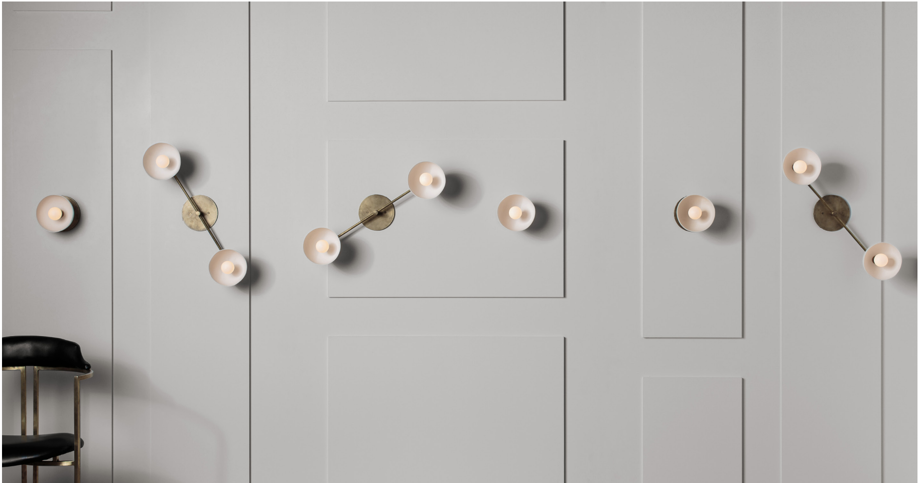
AGED BRASS / PORCELAIN