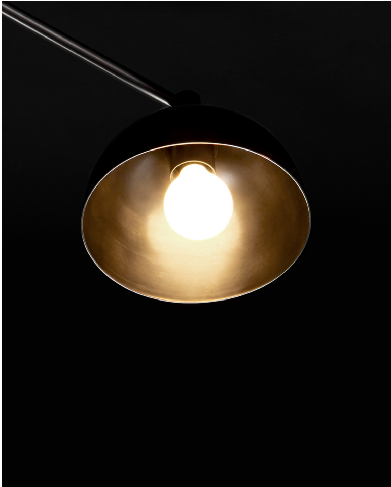
AGED BRASS / BLACKENED BRASS