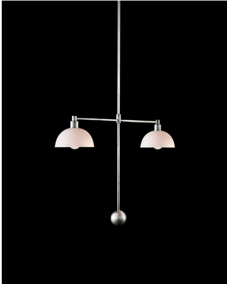
TARNISHED SILVER / PORCELAIN