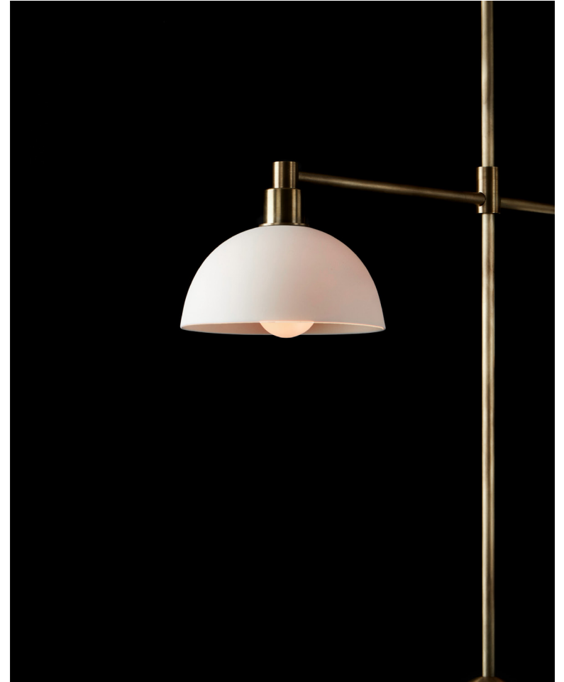
AGED BRASS / PORCELAIN