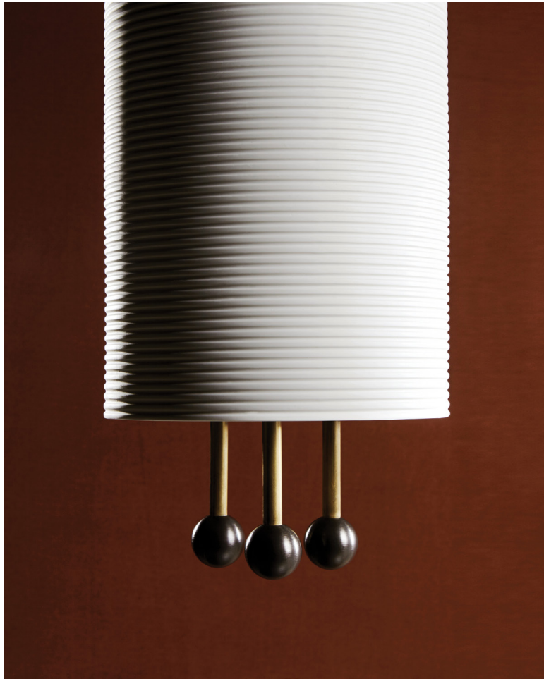
AGED BRASS / BLACKENED BRASS