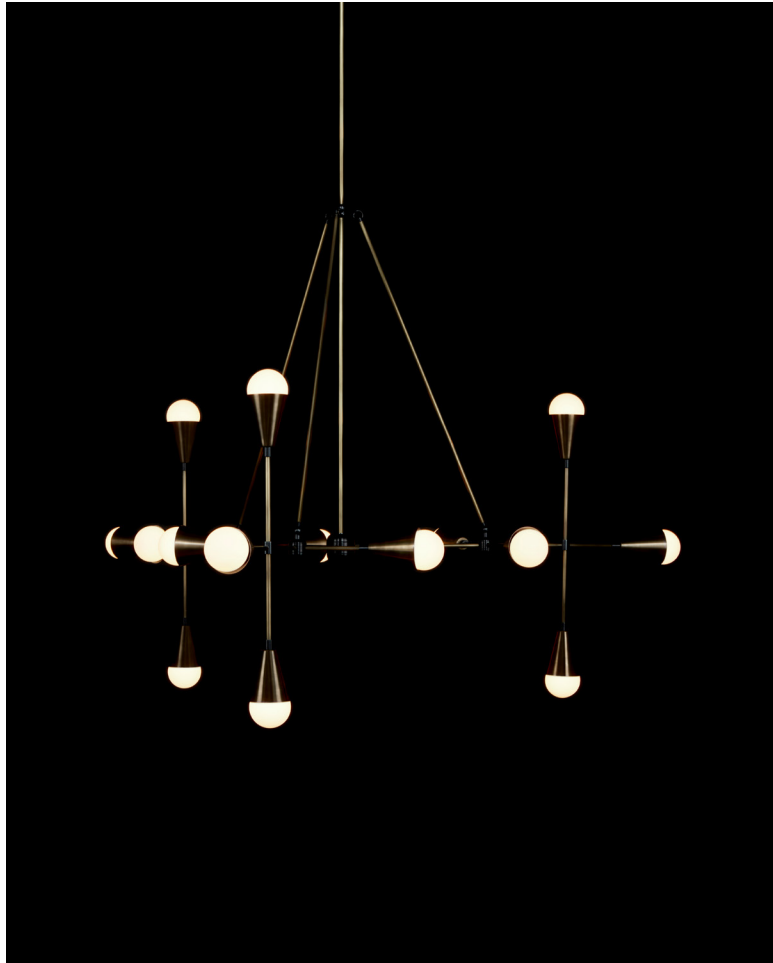
AGED BRASS / BLACKENED BRASS