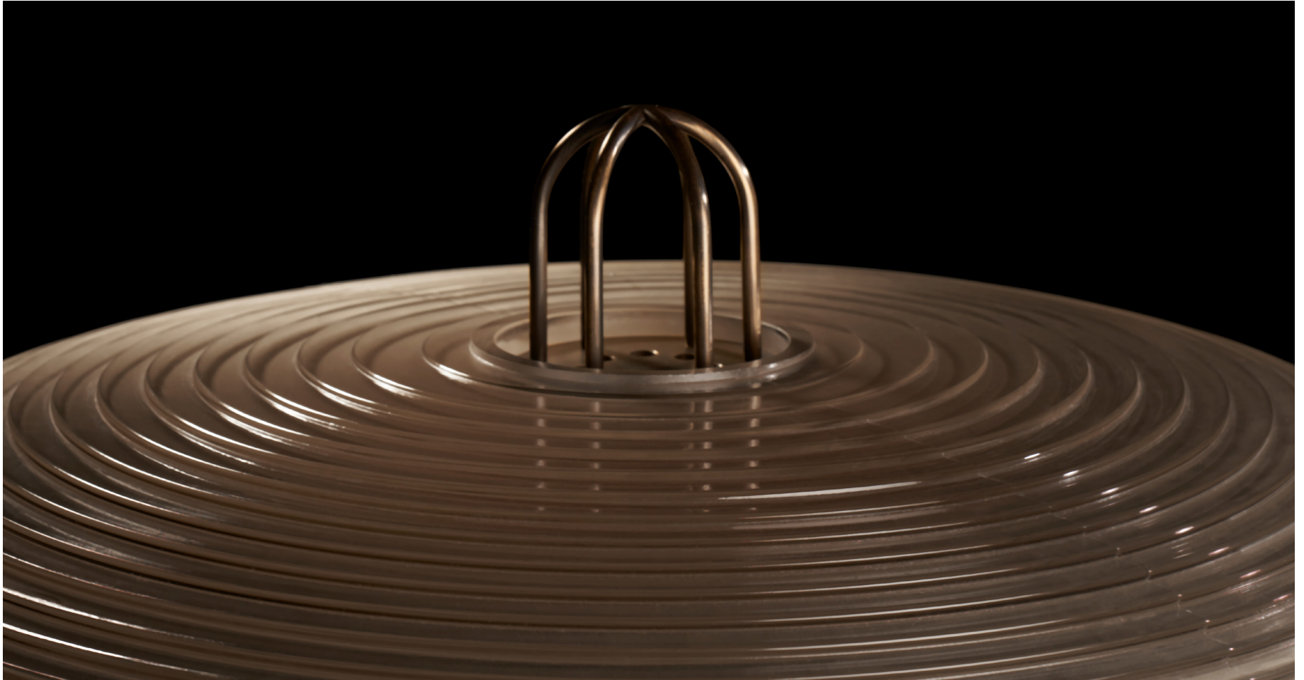
TARNISHED SILVER / SMOKED GLASS