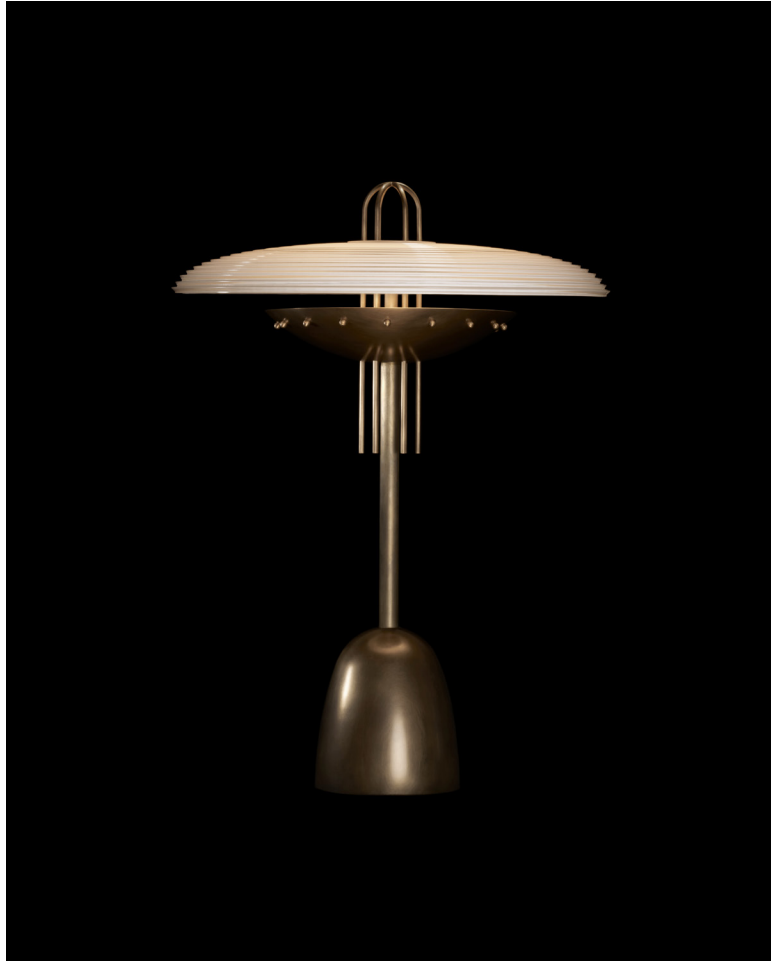
OIL-RUBBED BRONZE / CLEAR GLASS