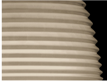
GLASS : SMOKED