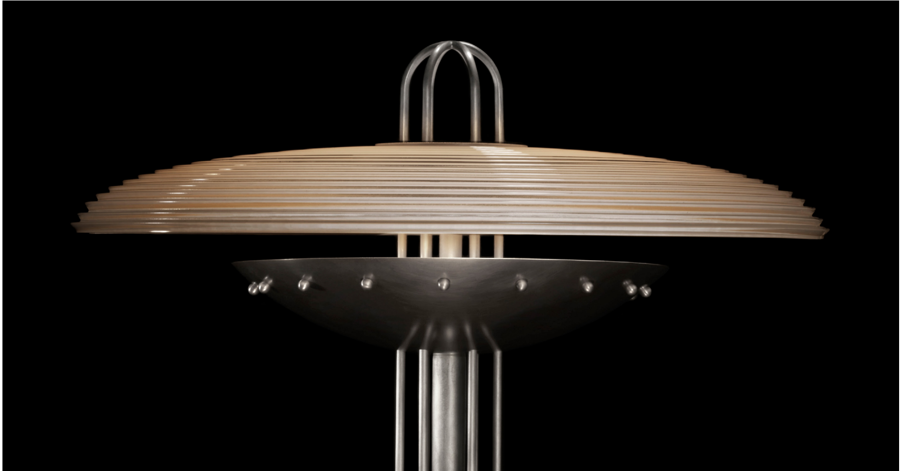
TARNISHED SILVER / SMOKED GLASS