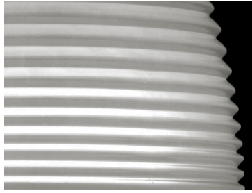
GLASS : CLEAR