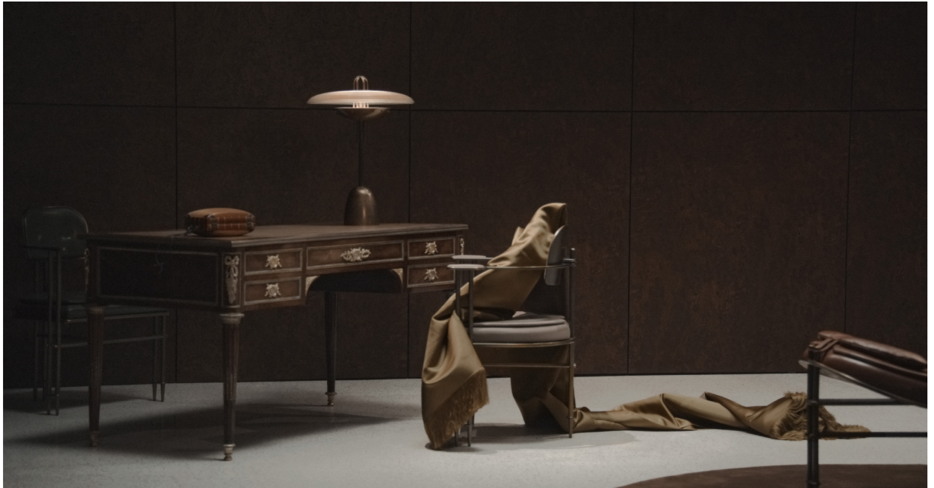
OIL-RUBBED BRONZE / CLEAR GLASS