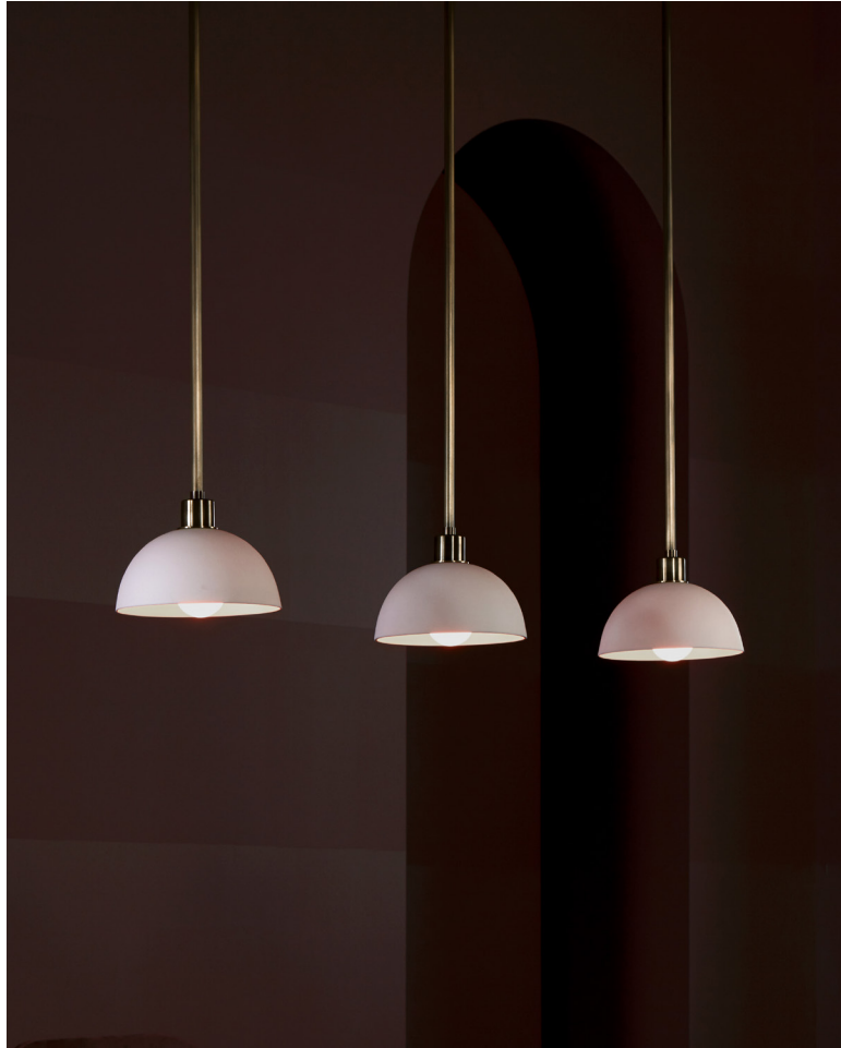
AGED BRASS / PORCELAIN