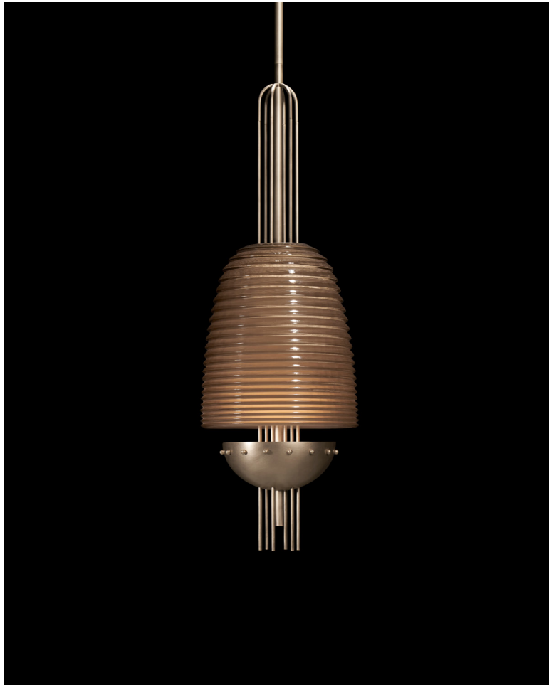
LARGE, TARNISHED SILVER / SMOKED GLASS