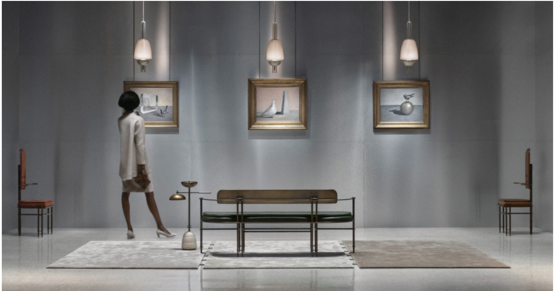
LARGE, TARNISHED SILVER / CLEAR GLASS