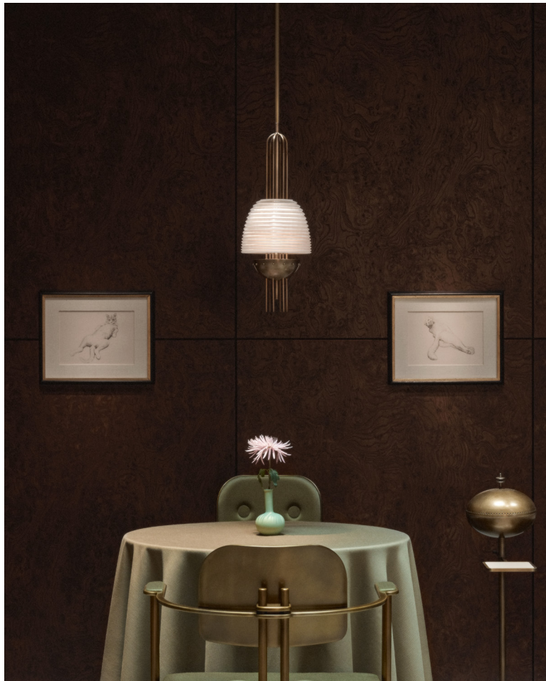
SMALL, AGED BRASS / CLEAR GLASS