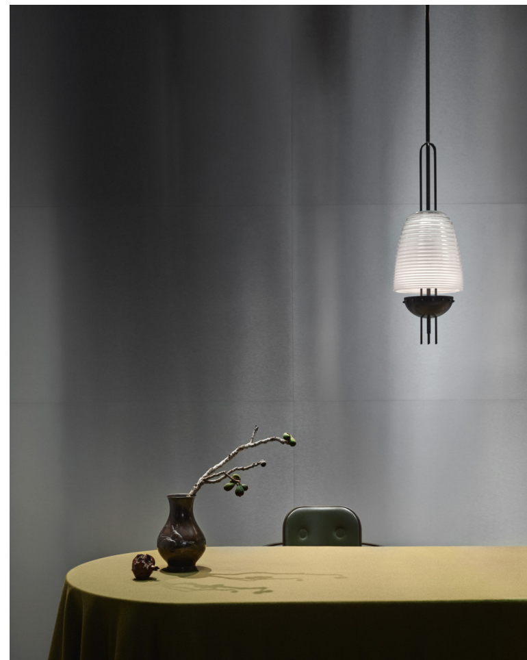
LARGE, BLACKENED BRASS / CLEAR GLASS