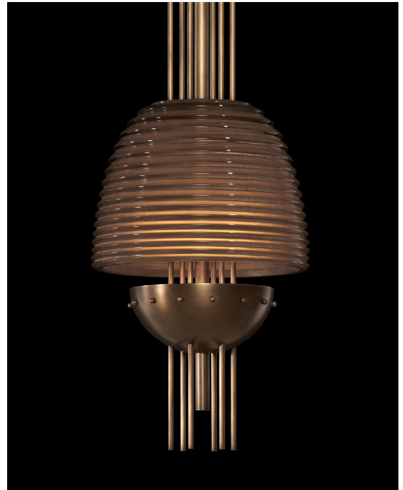
SMALL, AGED BRASS / SMOKED GLASS