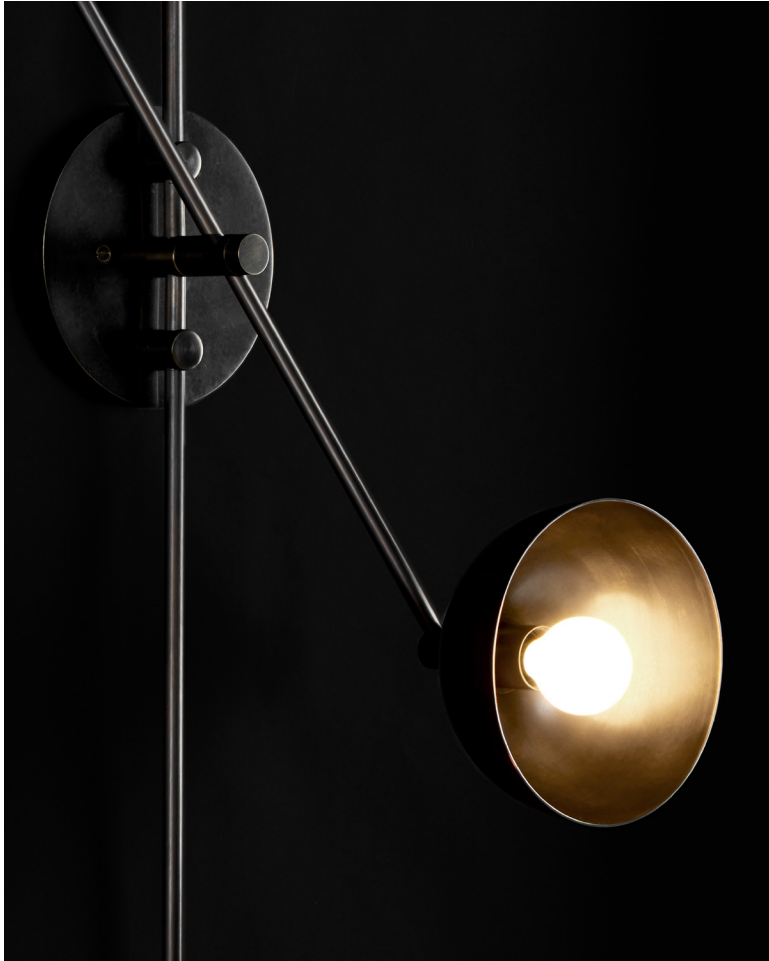
AGED BRASS / BLACKENED BRASS