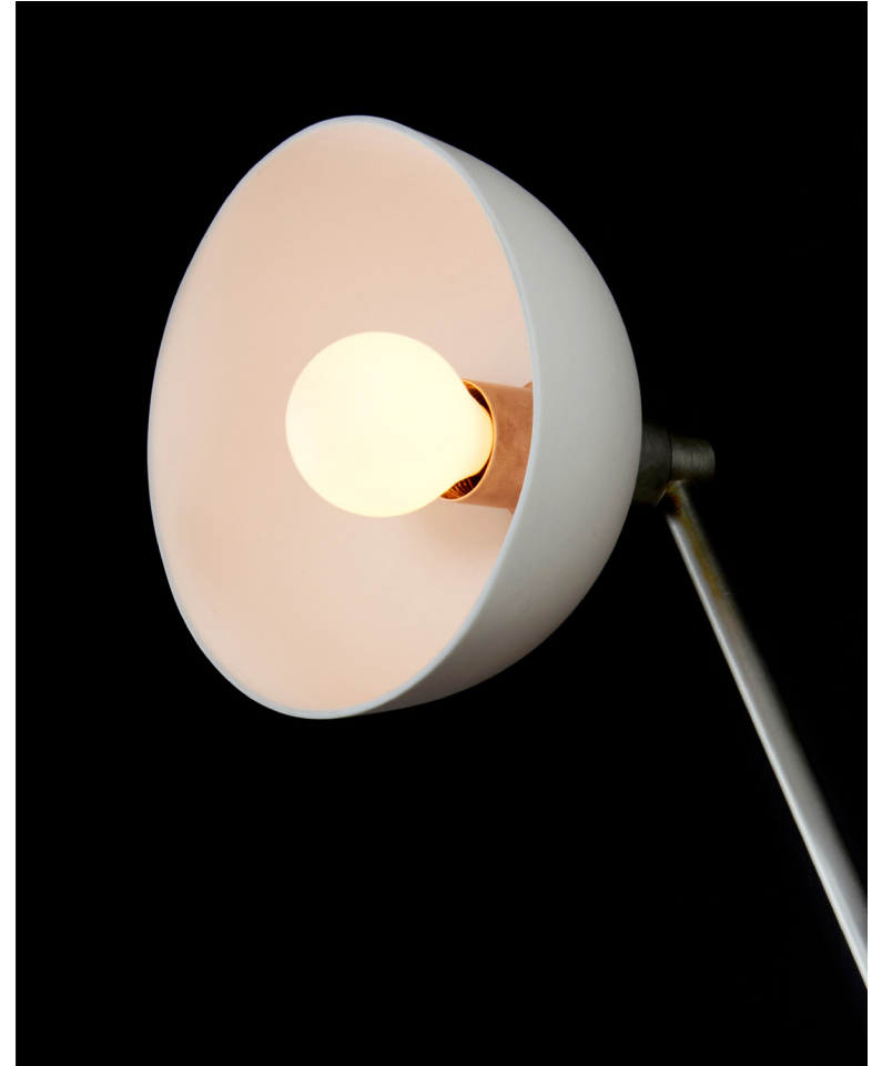
TARNISHED SILVER / PORCELAIN