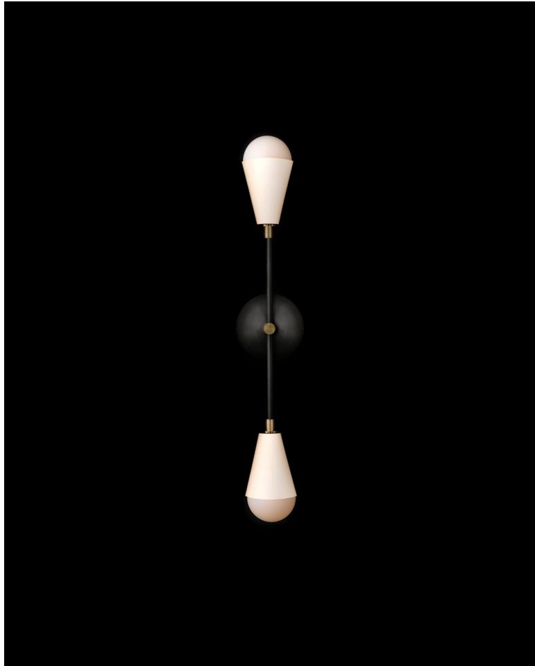
AGED BRASS / BLACKENED BRASS / PORCELAIN