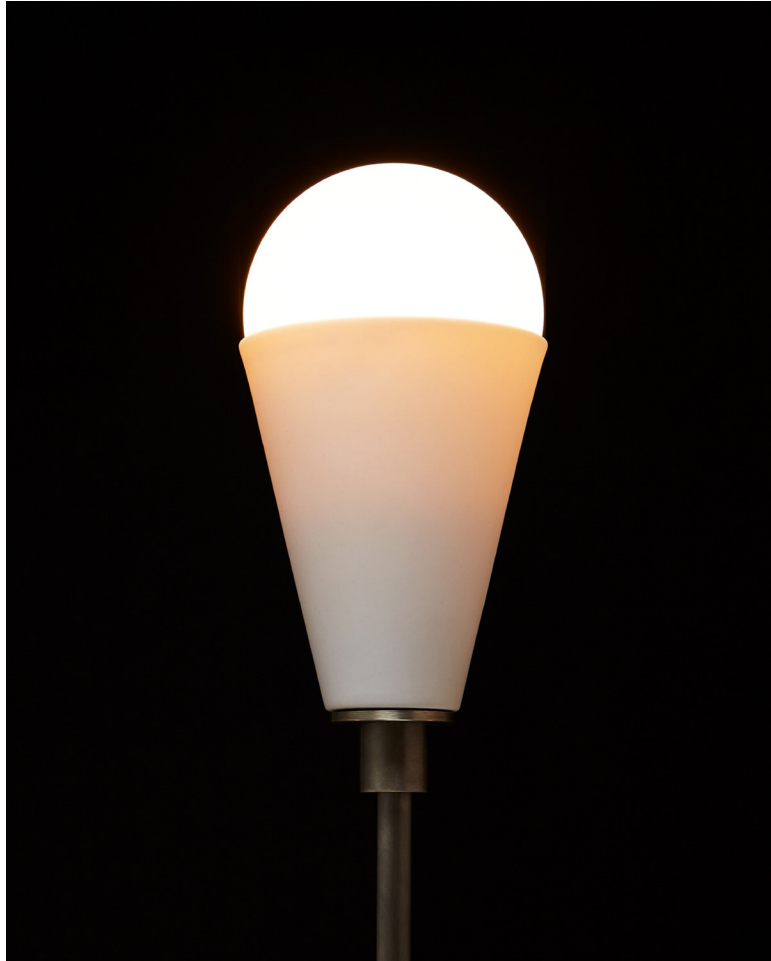
AGED BRASS / PORCELAIN