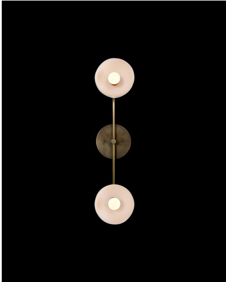
AGED BRASS / PORCELAIN