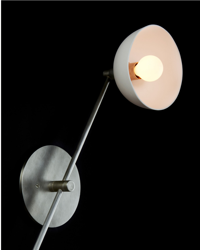
TARNISHED SILVER / PORCELAIN