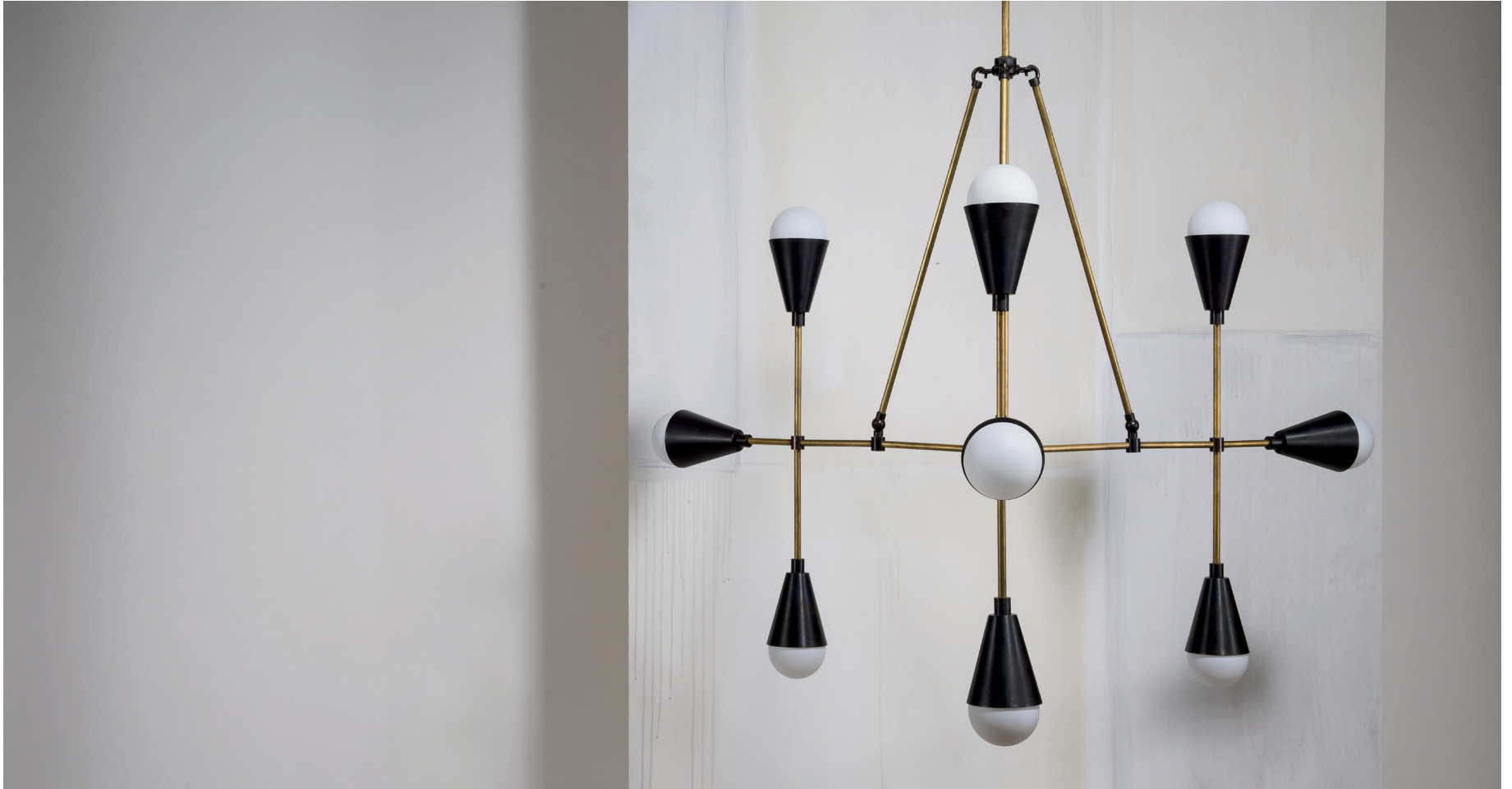
AGED BRASS / BLACKENED BRASS