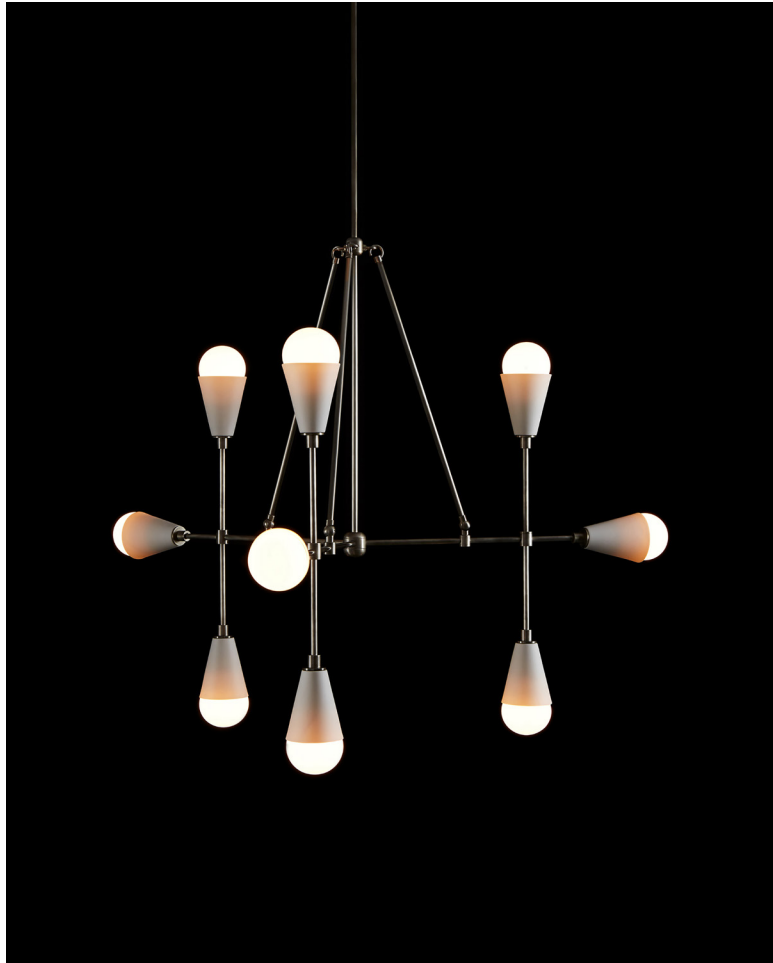
AGED BRASS / PORCELAIN