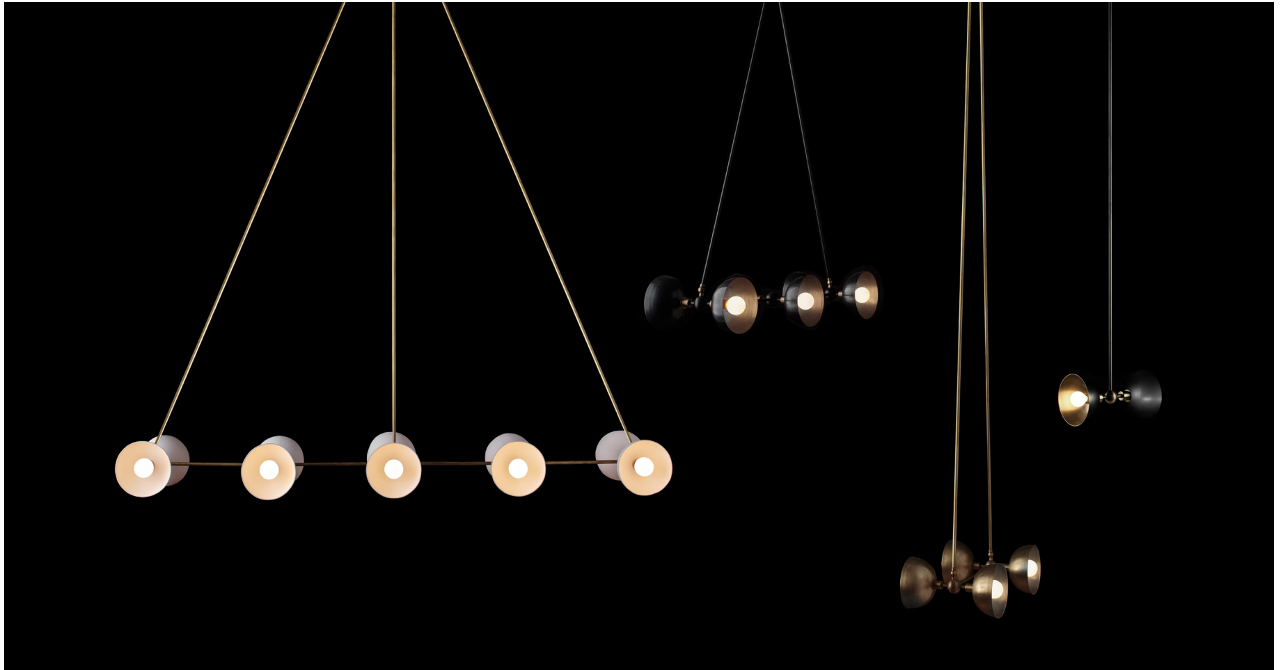
AGED BRASS / PORCELAIN