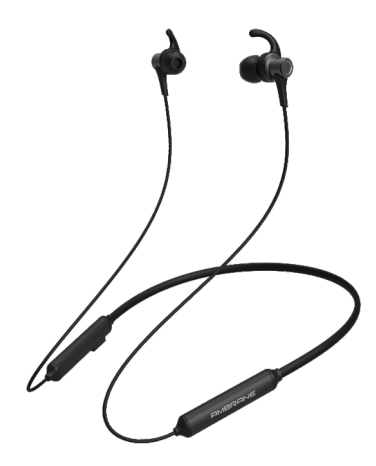
Experience True Sound