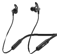
ANB-83 Pro Wireless Earphones