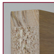
Side view of lipping and core