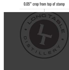
CROPPED STAMP ON 90% BLACK IN 100% BLACK, ROTATED AT 15° CLOCKWISE