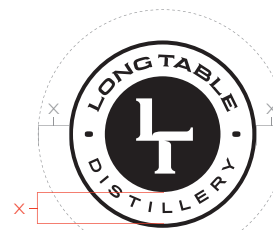
X = MINIMUM CLEARANCE SPACE

There must always be a clear space around the Monogram equal to or larger than the vertical height of the white space in the monogram, represented by X. The Standard Monogram should never be produced smaller than 0.5" wide.