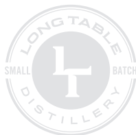
12% BLACK MONOGRAM