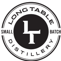
100% BLACK MONOGRAM

The Large Monogram is used for large-scale applications, such as building signage. This format may also be used on additional applications with approval from Long Table Distillery.