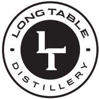
100% BLACK MONOGRAM

The Standard Monogram is used as a secondary design element on corporate print and packaging materials. The Monogram must only be reproduced from original digital files.