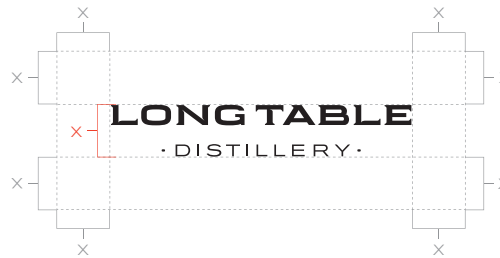
X = MINIMUM CLEARANCE SPACE

There must always be a clear space around the logo equal to or larger than the vertical height of the logo, represented by X.