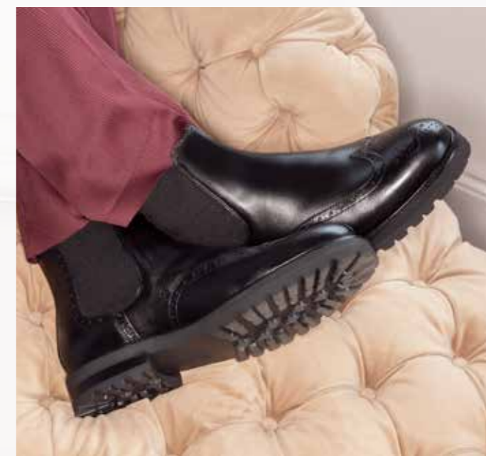
GRAY Black | Tan Leather UK Sizes: 6-13 Available: End of September £110