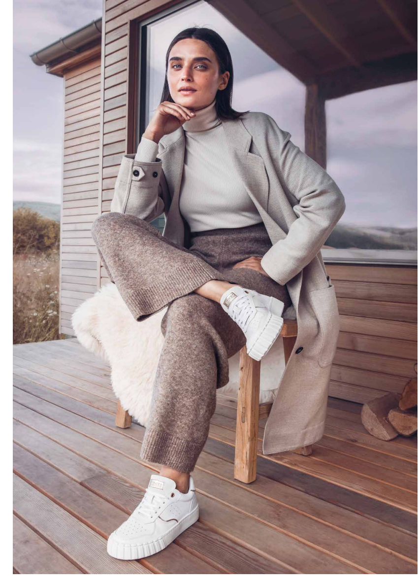
NORAH White | Black | Beige Leather