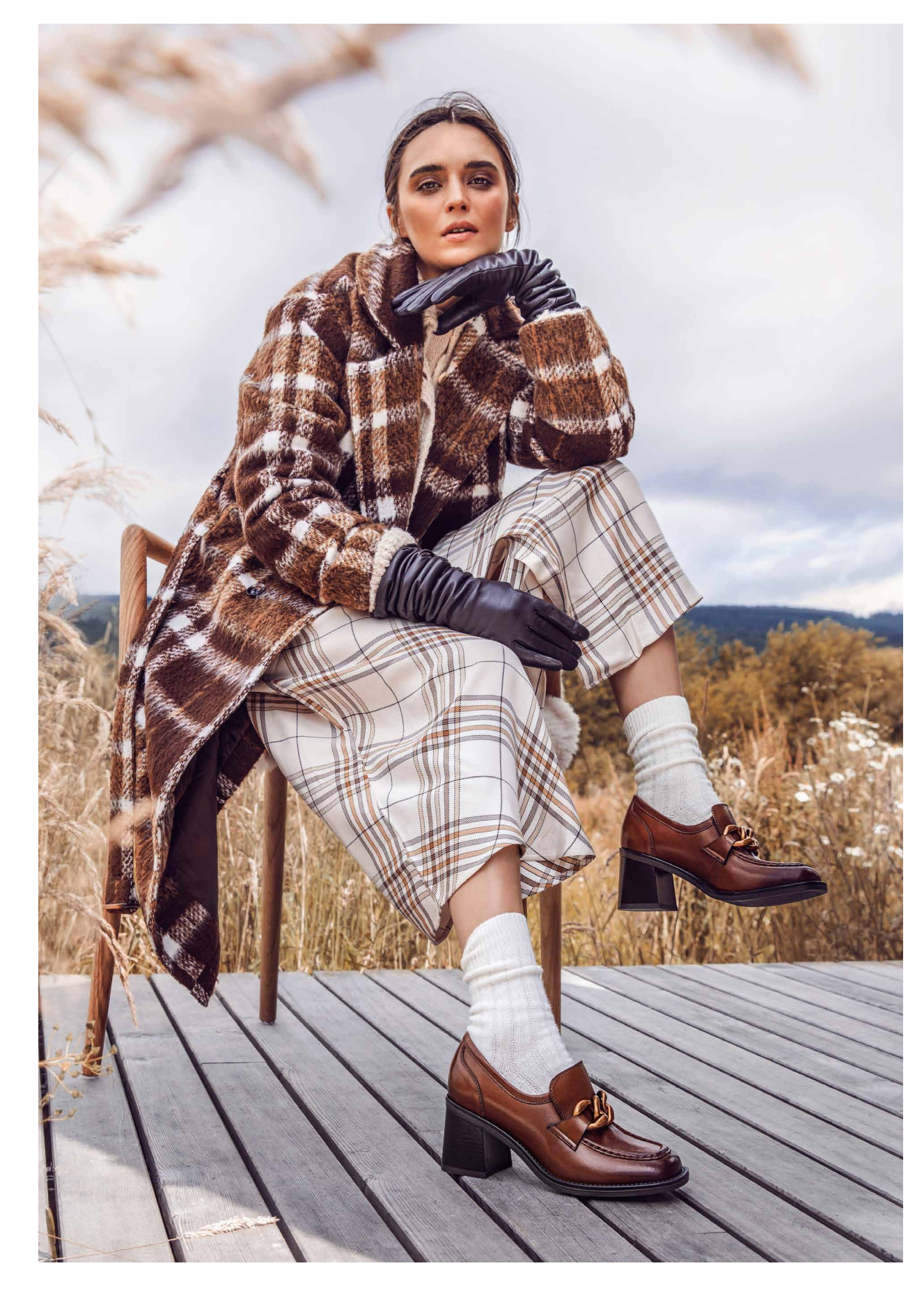
G \ E \ N \ E \ V \ R \ A Brown | Black Leather £125