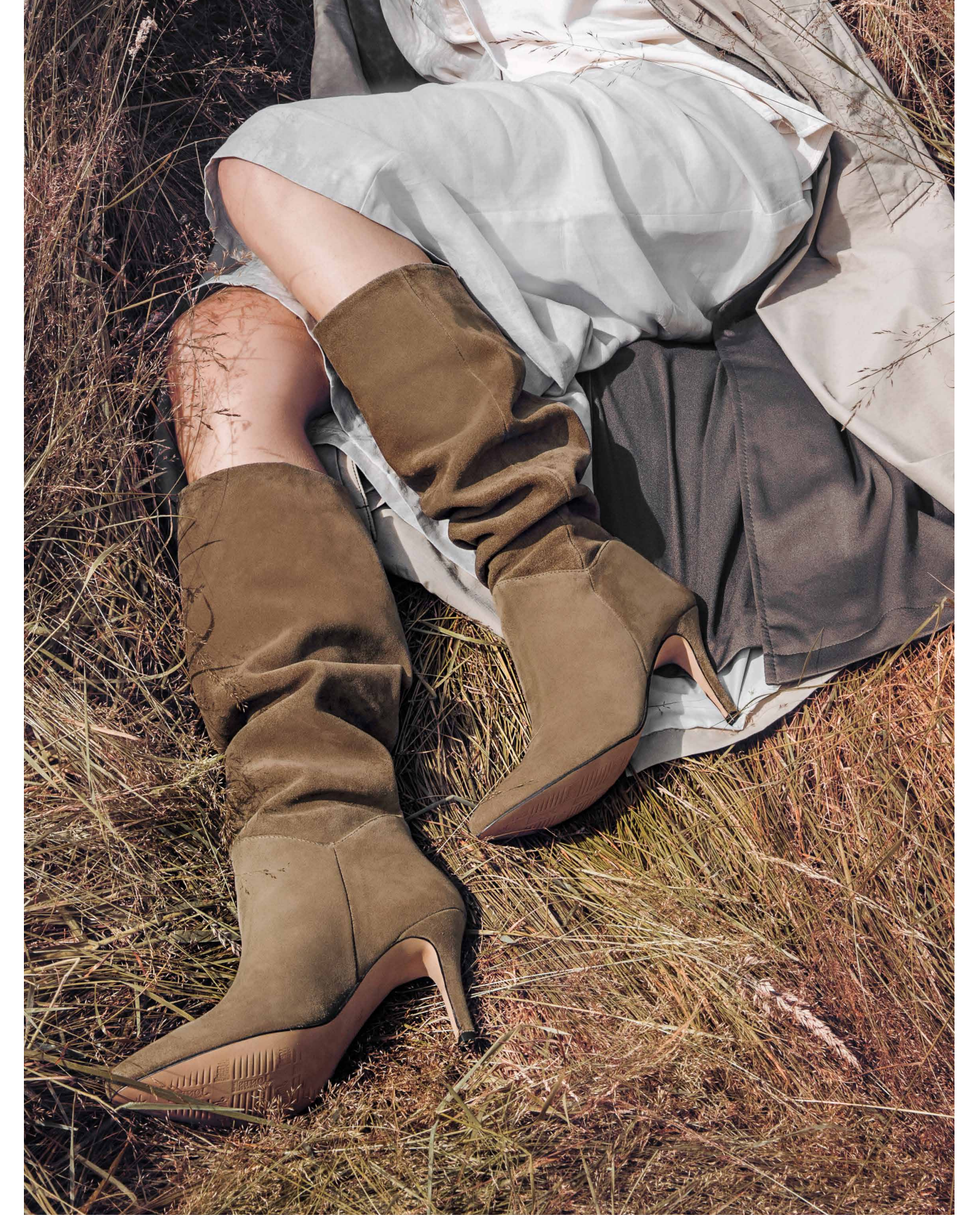
LUZ Forest Green | Beige | Black | Grey Suede Leather £165