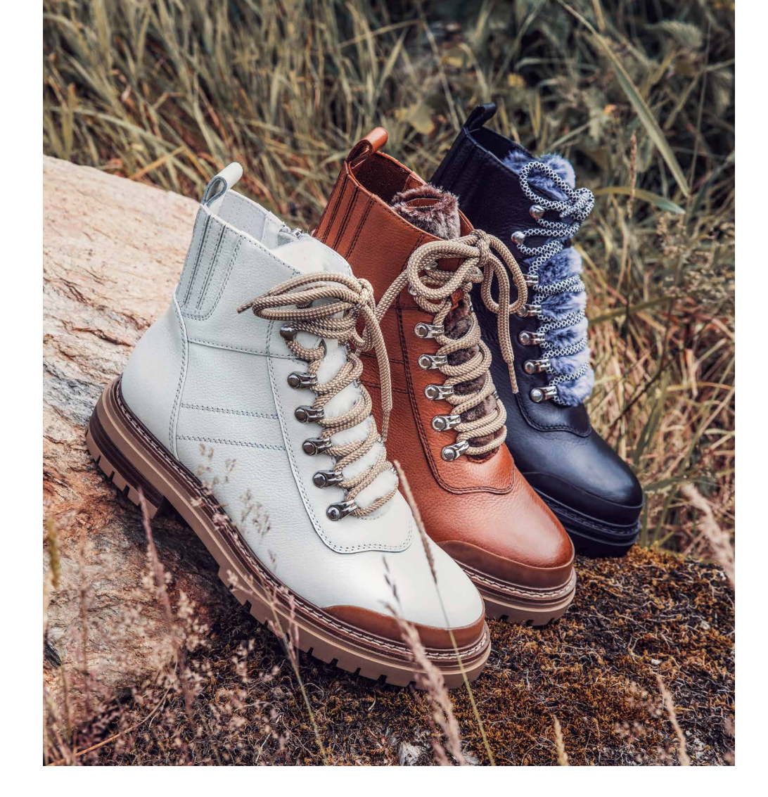
S~U~S~A~N~N~A White | Tan | Black Leather £145