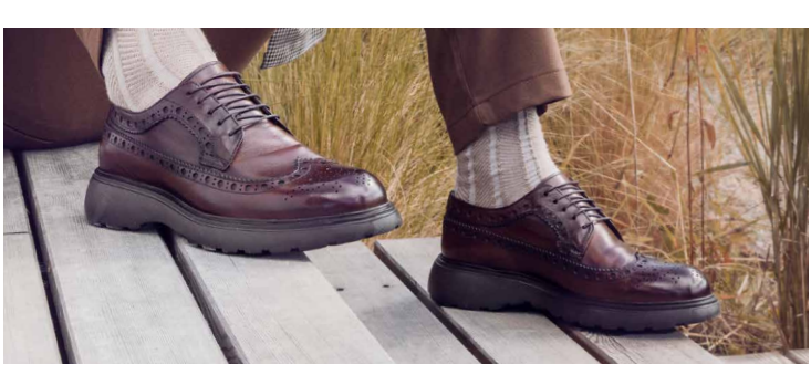
LOFTUS Black | Cognac Leather