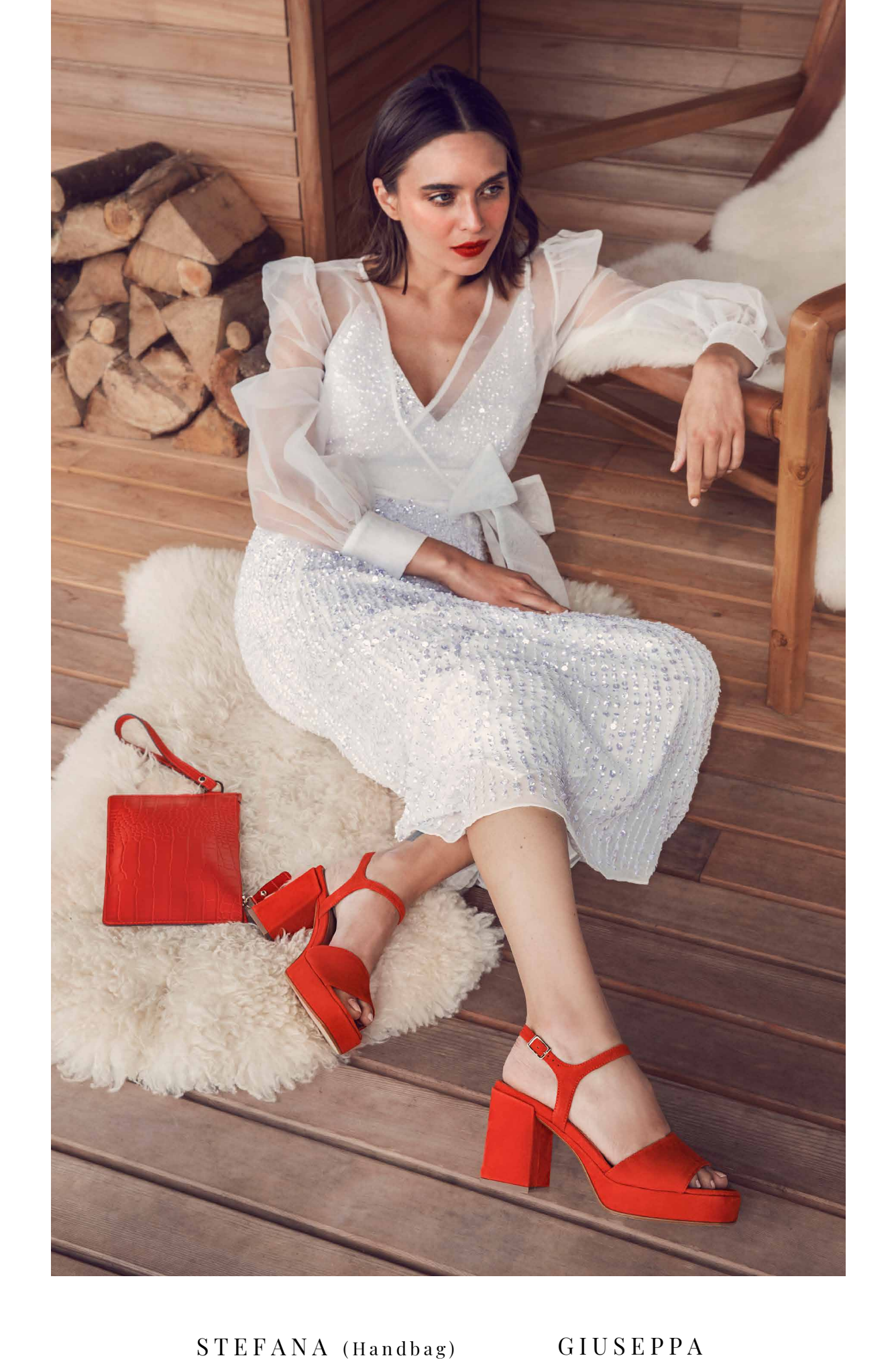
STEFANA (Handbag) Red | Black | Cream Leather