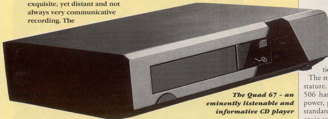
The Quad 67 - an eminently listenable and informative CD player

The Mendelssohn set a true pattern, which was repeated with mild changes of emphasis with various types of music. But I don't want this to be seen as a walkover for either party. These are both excellent CD players, each of which makes a strong claim for itself, and where preferences are as much