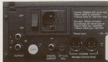
The 506 can communicate with other Meridian items via its comms channel

The Meridian 506 is more muscular, and is better able to convey tension and dynamic range. Curiously, one of the best examples to illustrate this was a recording of Ernest Bloch Schelomo played by the Eastman-Rochester Orchestra and conducted by Howard Hanson (Mercury Living Presence). Recorded in glorious analogue, this recording dates from over two decades before the widespread application of digital technology.