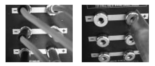
To convert KABERs to BI-WIRED mode remove the black-ringed (negative) input terminal collars using the key provided. Fit the two way plate supplied over the bottom two sockets and replace the terminal collars. Repeat this operation with the red (positive) terminals. (see below)

As previously mentioned under GENERAL INFORMATION, KABERs are supplied configured for use in TRI-WIRED mode. (see below)