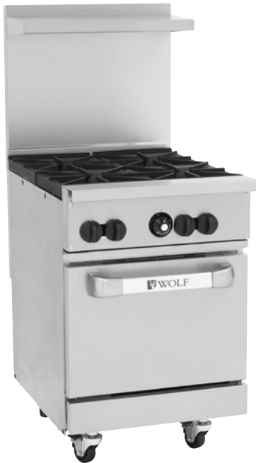
Model C24S-4BN (shown with optional casters)