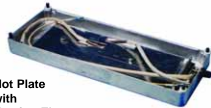
Hot Plate with Heating Element