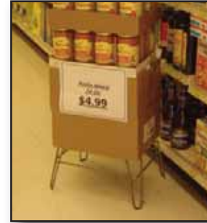
Ideal for Dishroom Chemical Stand