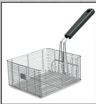
Optional 3 lb. Single Basket Available #LFB75