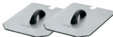
Night Covers NC100/NC150