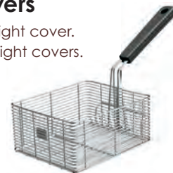
Large Single Basket LFB10/LFB15