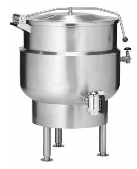
Model K20DL shown with optional 2" plug valve