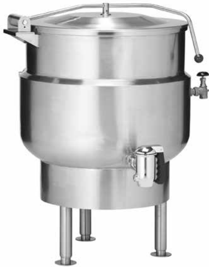
Model K20DL shown with optional 2" plug valve