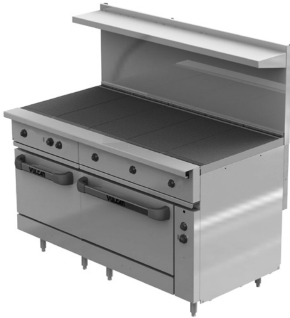
Model EV60SS-5HT208 shown with adjustable legs