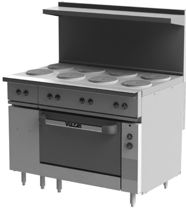
Model EV48S-8FP208 shown with adjustable legs