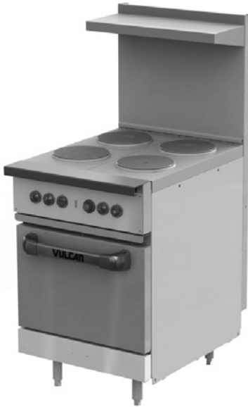
Model EV24S-4FP208 shown with adjustable legs