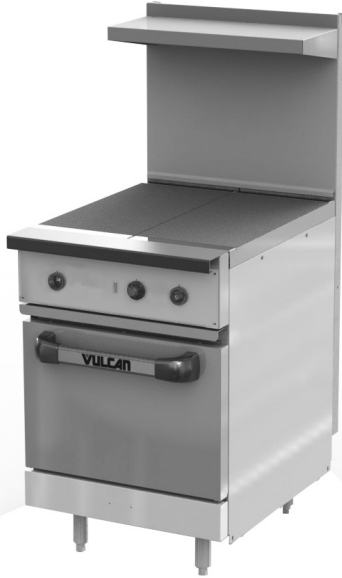
Model EV24S-2HT208 shown with adjustable legs