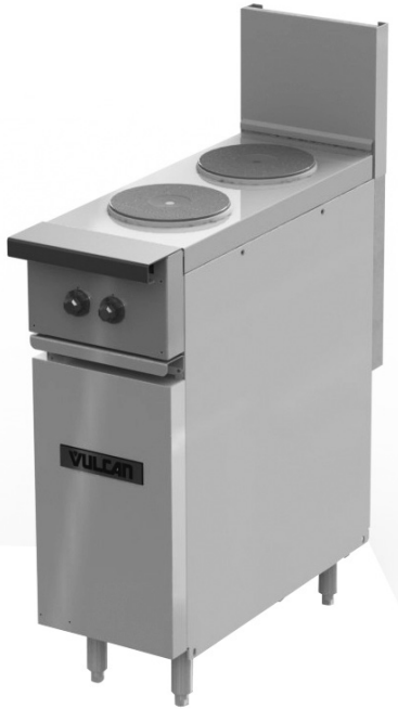
Model EV12-2FP208 shown with adjustable legs