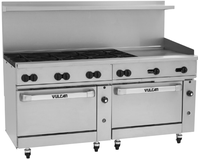
Model 72SC-8B-24G-N (shown with optional casters)