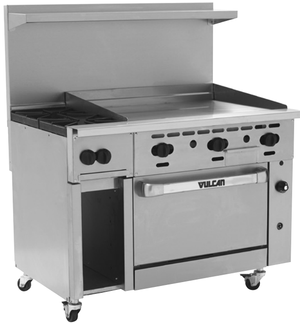
Model 48S-2B36GN (shown with optional casters)