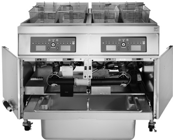
Model 2ER85CF Shown on casters (Accessory)