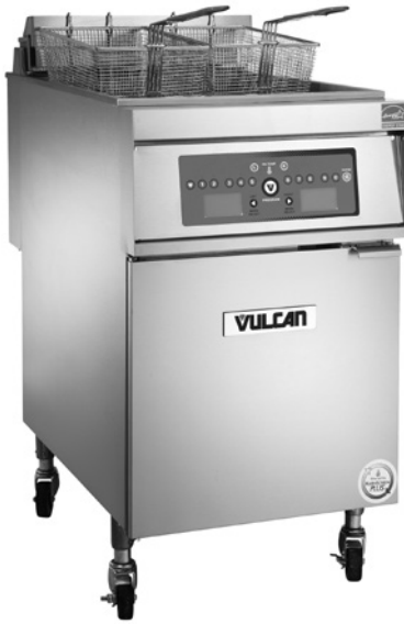
Model 1ER85C Shown with caster accessory