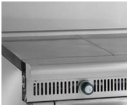
Even heating across entire Hot Top surface.