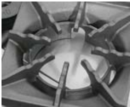
Wavy grates raise pan creating more heat transfer than direct metal-to-metal contact.