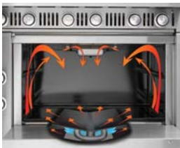
"M" shaped burner for even heating throughout the oven cavity.