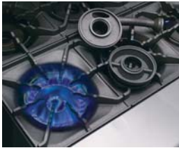
35,000 BTU/hr. (10 KW) anti-clogging, removable burner.

IHR-2-1HT IHR-4-1HT-XB IHR-2-1HT-C IHR-4-1HT-M IHR-2-1HT-XB IHR-3HT-3 IHR-2-1HT-M IHR-3HT-3-C IHR-4-1HT IHR-3HT-3-XB IHR-4-1HT-C IHR-3HT-3-M