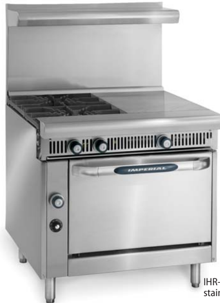
IHR-2-1HT shown with optional stainless steel backguard and shelf