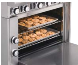
Accommodate sheet pans front-to-back and side-to-side.