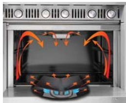
"M" shaped burner for even heating throughout the oven cavity.