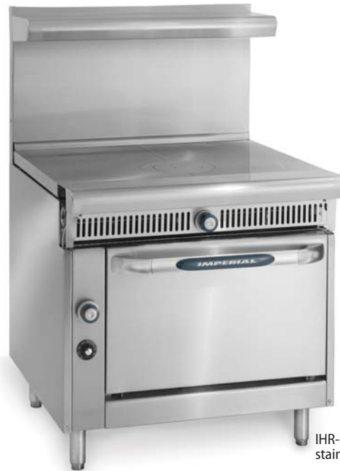
IHR-1FT shown with optional stainless steel backguard and shelf