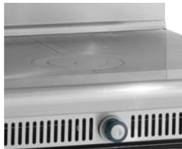
French Tops have circular cast iron ring and lift-off cover directly over burners.

IHR-2FT IHR-1FT IHR-2FT-C IHR-1FT-C IHR-2FT-XB IHR-1FT-XB IHR-2FT-M IHR-1FT-M