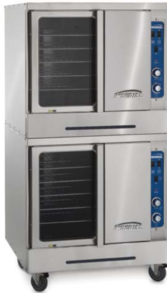
ICVE-2 shown with optional casters

Four bearings per door extend the life of the door mechanism.