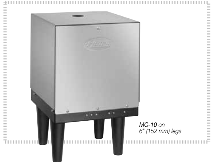
MC-10 on 6" (152 mm) legs