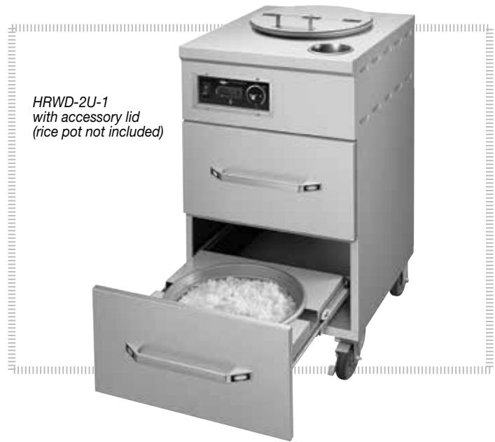
HRDW-2U-1 with accessory lid (rice pot not included)