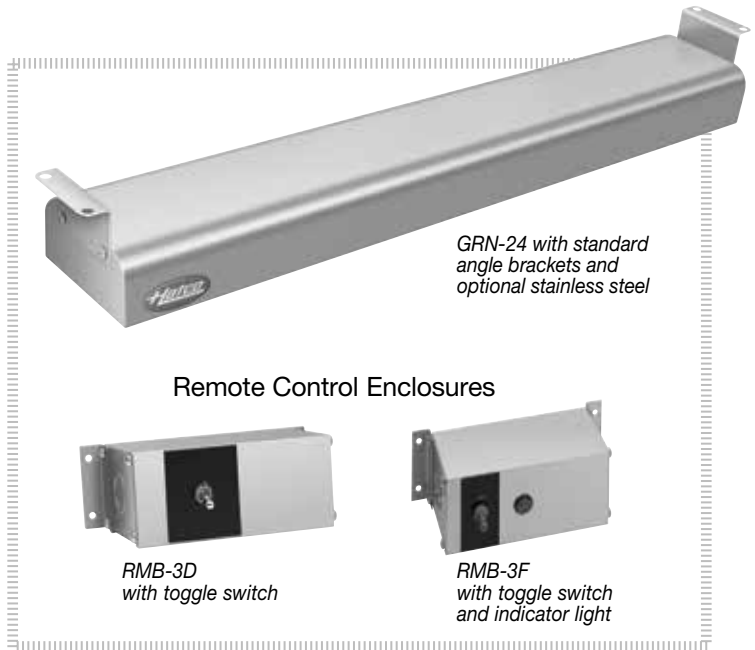
GRN-24 with standard angle brackets and optional stainless steel