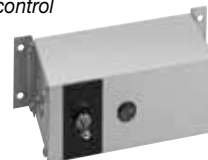
RMB-3F with toggle switch and indicator light