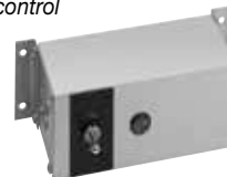
RMB-3F with toggle switch and indicator light