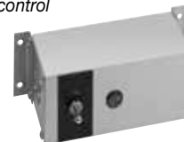
RMB-3F with toggle switch and indicator light