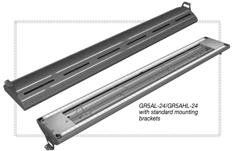
GR5AL-24/GR5AHL-24 with standard mounting brackets

† Non-standard colors are non-returnable